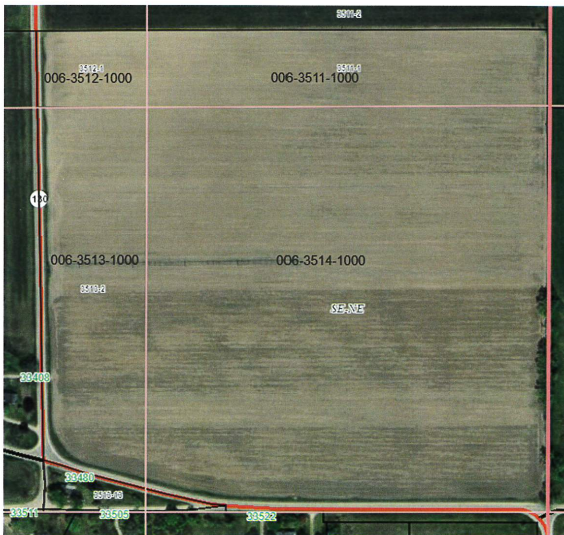
Temporary Limited Easement - Parcel Locations

Easement will expire at the end of construction of said irrigation equipment.